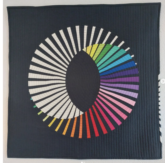
Maker: @claudi.lang on Instagram

We'll be using the Swoop Quilt Block to demonstrate and practice curved partial seams in class. Please see below for the fabric remnants needed for this test block. These can easily be selected from the remnant bin. An example block is pictured to the right. This block is made with two feature fabrics (wasabi and glacier) and background fabric (snow).